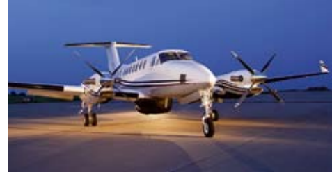
KING AIR 350