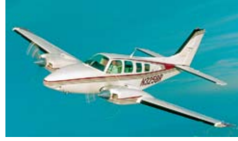
BEECHCRAFT BARON G58