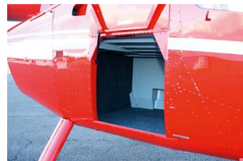
An 18 cubic foot baggage locker will easily accommodate 300lb of suitcases, golf clubs, etc.