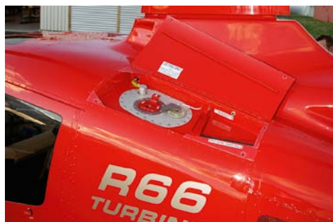
A single fuel filler for the bladder fuel tank is hidden behind a hinged panel out of the airstream.

Fuel is located in one tank, so gone is the two tank system of the R22 and R44 and fuelling is now from a single point. Also gone is the fuel cap protruding out into the airstream as the cap is now located under a flap which closes flush with the fuselage. Pre-flight is entirely normal and straight forward, with built in steps enabling the pilot to climb up to inspect the main rotor hub and blades.