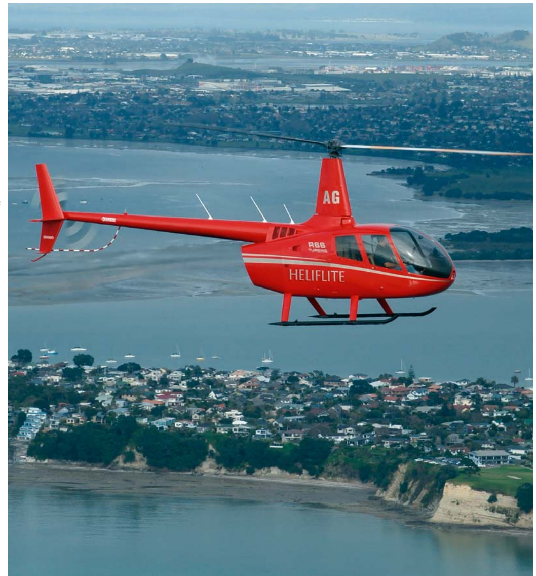
Heliflite Pacific's first R66 (now sold) cruising up Auckland's East Coast north of Ardmore.