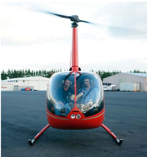
The cabin is almost 8 inches wider than an R44.