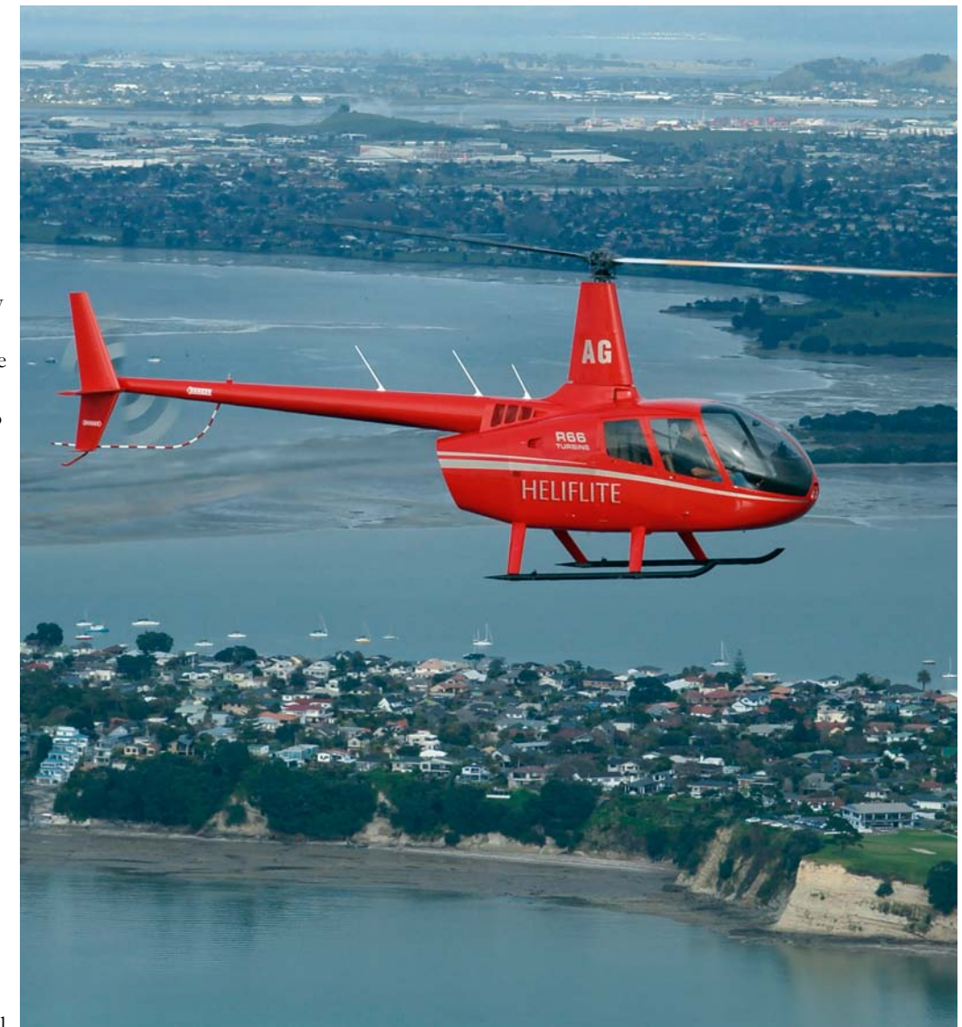
Heliflite Pacific's first R66 (now sold) cruising up Auckland's East Coast north of Ardmore.