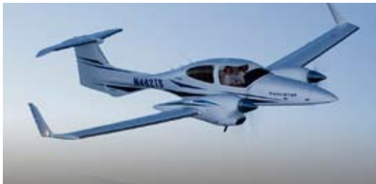
The Diamond DA-42 powered by two counter rotating Lycoming IO-360s.