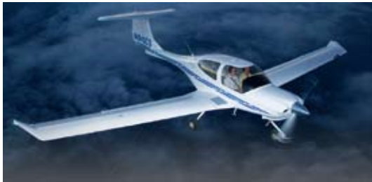
The Diamond DA-40 powered by Lycoming IO-360.